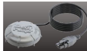
Puddle Sensor Model ALM-PK-EYE (For floor level water sensing)