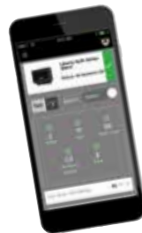
Normal Status Screen