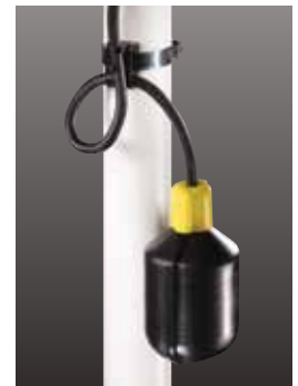
Wide Angle Float Model ALM-2-EYE (Recommended for Sewage Applications)