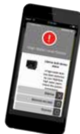
Alarm Notification Screen

New! Super-bright LED alarm ring - Increases visibility