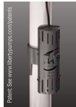
Snap-on Compact Float Model ALM-P1-EYE (Sump Pump Applications)

New! Super-bright LED alarm ring - Increases visibility